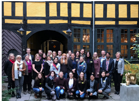
Participants gathered outside Admiral Gjeddes Gaard, Copenhagen, Denmark